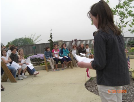
5 th grade participation at Memorial Day Ceremony