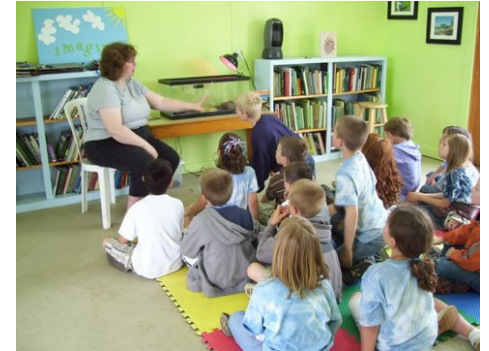
2 nd grade in class at The Arboretum